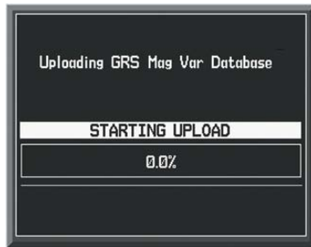
Figure B-13 Uploading Database to GRS