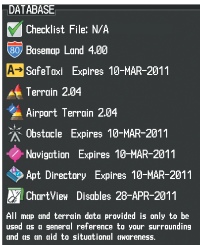
Figure B-10 Database Information on the Power-up Screen