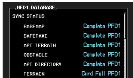
Database Synchronization Error Message Figure B-9 Synchronization Error Message

If an error occurs during the synchronization, an error message will be displayed, followed by the affected display in the Sync Status section of the Database Window (Figure B-9). If a synchronization completes on one display, but an error occurs on the other, the error message will be displayed with the affected display listed after it. When an error message (Table B-1) is displayed, the problem must be corrected before the synchronization can be completed. A power cycle is required to restart synchronization when 'Card Full' or 'Err' is shown.