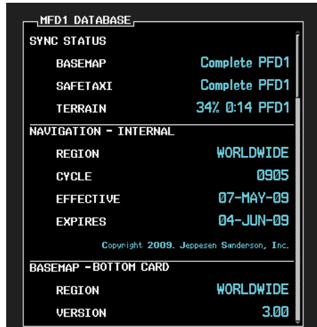
Figure B-8 AUX-System Status Page, Database Window

An indication of 'Complete' still requires a power cycle before the synchronized databases will be used by the system.